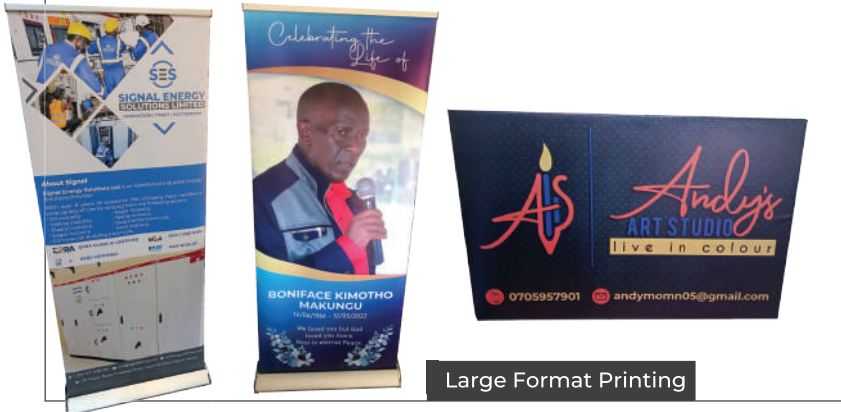
Large Format Printing